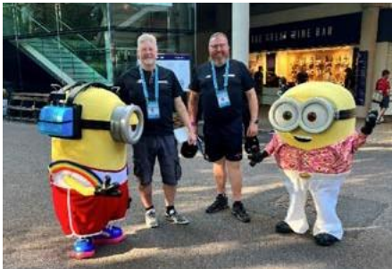
Event Safeguarding Officers were recruited and deployed at each of the eight Hundred venues.